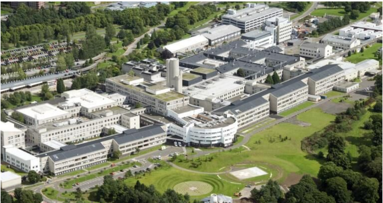
Ninewells Hospital, Dundee