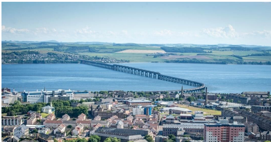
Tay Rail Bridge seen from The Law