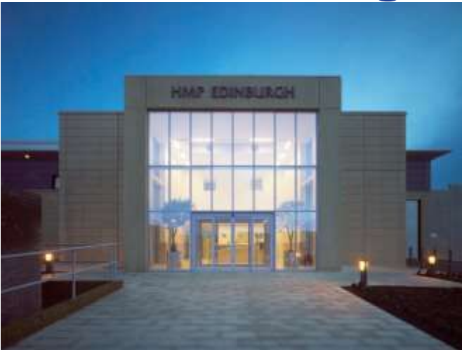
Situated in Edinburgh