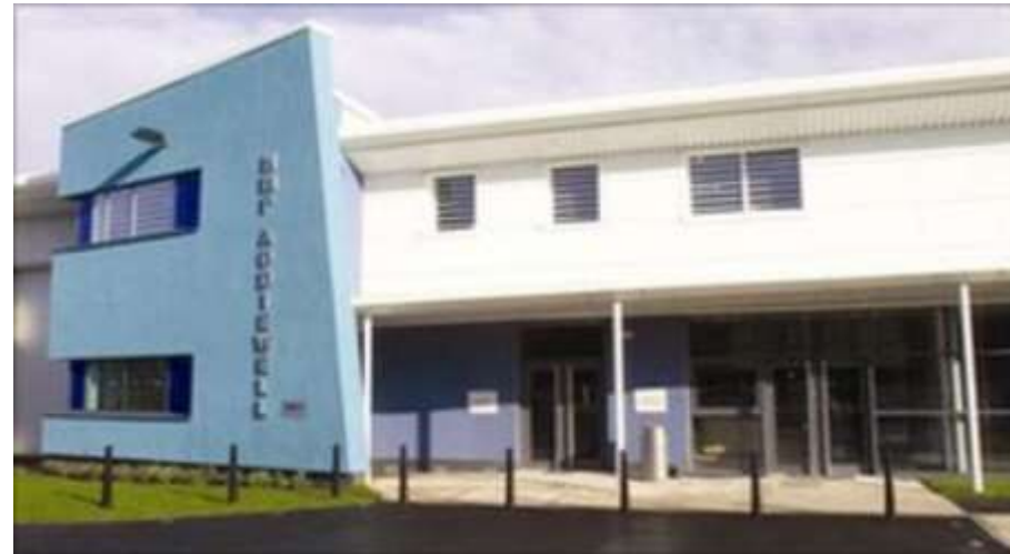
Situated in West Lothian