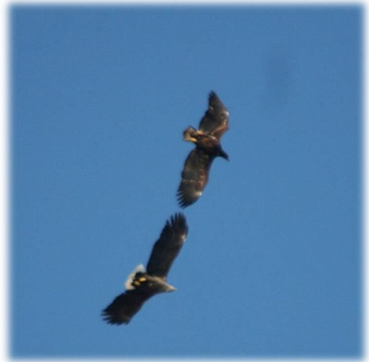
SEA EAGLE AND GOLDEN EAGLE