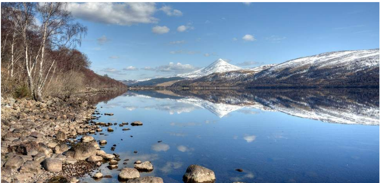
Loch Rannoch with the peak of Schiehallion reflected

There are two hospitals which admit acute general medical patients and provide in-patient services; Ninewells Hospital, Dundee and Perth Royal Infirmary. The hospitals are 20 miles apart and there is a direct bus service to facilitate travel. There are a number of intermediate care hospitals in Perth & Kinross which also provide out-patient services. Ninewells Hospital and Medical School in Dundee provides centralised care for acute surgical acute surgical specialties and some emergency medical services such as coronary angiography, dialysis and hyper-acute stroke. During the COVID pandemic, the viral pathway has been centralised to Ninewells Hospital. Specialty services work closely across sites to provide subspecialty access for patients, but also allow clinicians to develop subspecialty interests, with many clinicians delivering subspecialty care on both sites.