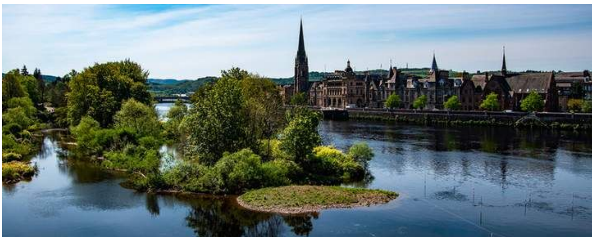
View of Perth City

The University of Dundee is involved in a range of partnership initiatives including a strong access programme and social, education, cultural, business and voluntary partnerships aimed at raising confidence, skills and achievement. The University has excellent working relationships with the City Council, other local authorities, Scottish Enterprise Tayside (the local economic development company), NHS Tayside and a range of other local & national bodies in Scotland and the UK.