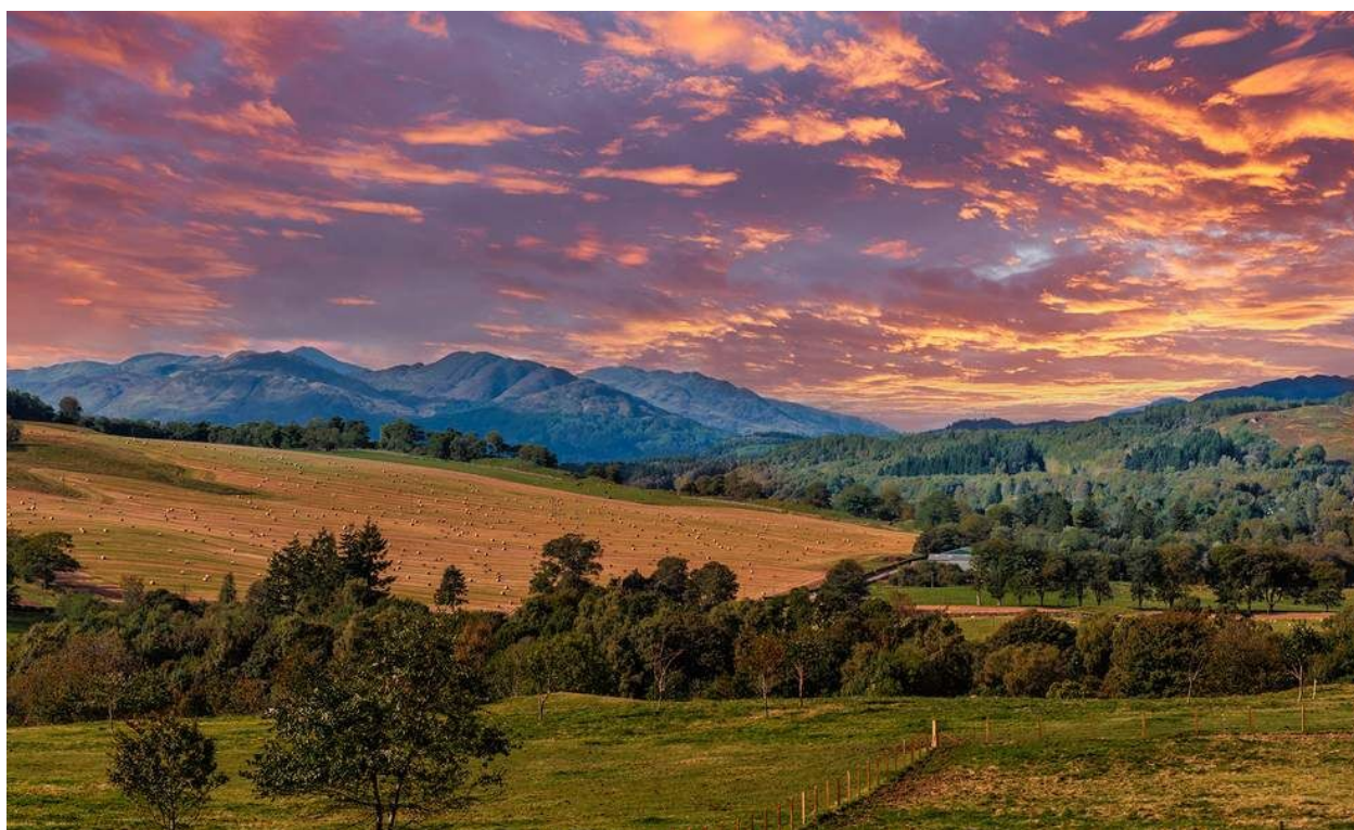
Crieff looking over to the great Ben Chonzie