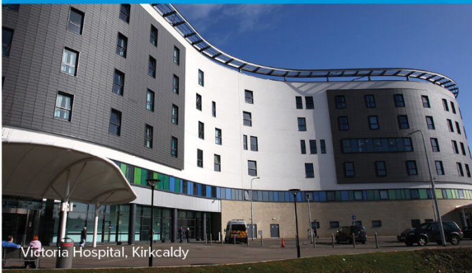
Victoria Hospital, Kirkcaldy