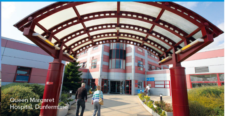
Queen Margaret Hospital, Dunfermline