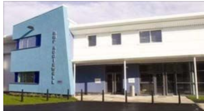
Situated in West Lothian