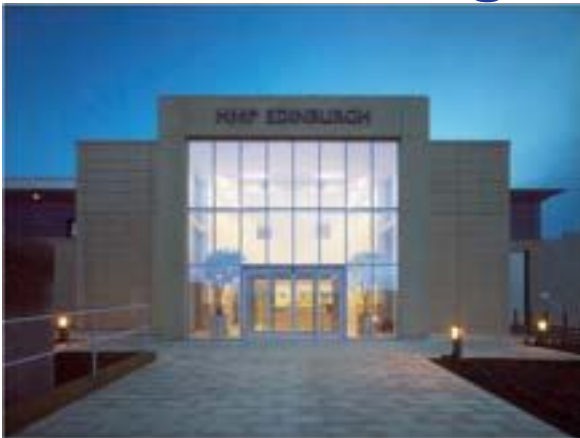
Situated in Edinburgh