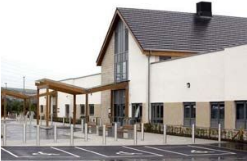
Situated to the south-east of Edinburgh in Dalkeith