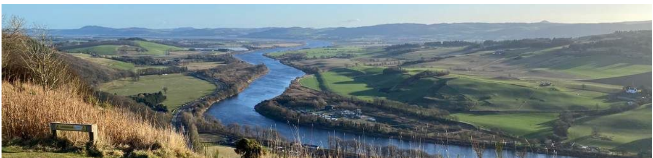
View from Kinnoull Hill

Dundee is also renowned as a friendly city where it is easy to mix. If your passion lies with the green, Tayside and North East Fife is one of the best places in the world for access to quality and affordable golf. 18 championship golf courses lie within 30 minutes and include St Andrews, the home of golf, Carnoustie and Gleneagles, which hosted the Ryder Cup in 2014. Within similar reach lie spectacular opportunities for everything from water sports to mountaineering, fishing and hillwalking.