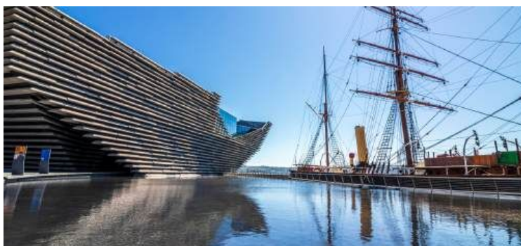
V&A Museum & The Discovery, Dundee

Excellent shopping sits side-by-side with a vibrant cultural quarter – home to Scotland's award-winning Dundee Rep Theatre and the highly acclaimed Dundee Contemporary Arts which has become a lively social hub and film house as well as a champion of leading edge arts. These are among the closest neighbours to our city centre campus. In addition, Dundee is the home of the 'V&A At Dundee', a new development housed in an award-winning, iconic building designed by Kengo Kuma.