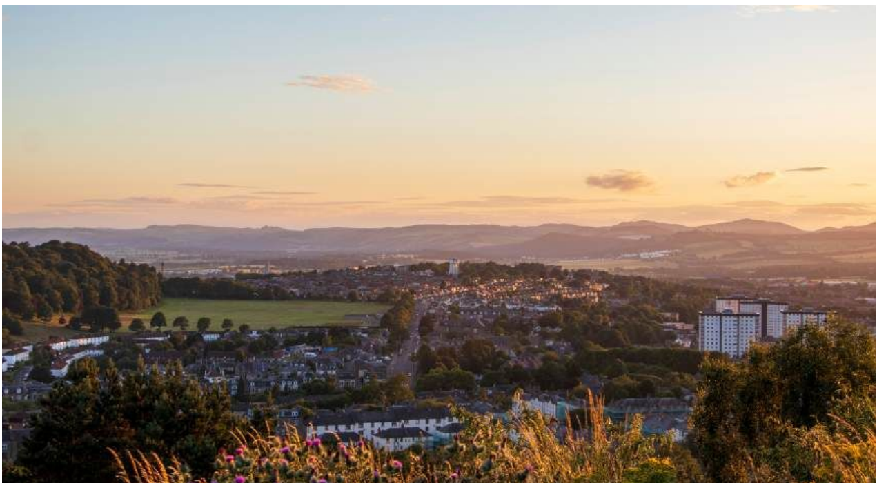
View across Dundee City

There are two hospitals which admit acute general medical patients and provide in-patient services; Ninewells Hospital, Dundee and Perth Royal Infirmary. The hospitals are 20 miles apart and there is a direct bus service to facilitate travel. There are a number of intermediate care hospitals in Angus and Perth & Kinross which also provide out-patient services. Ninewells Hospital and Medical School is a large teaching hospital for the University of Dundee and houses most medical and surgical disciplines with supporting laboratory services. Stracathro Hospital has been developed as an outpatient diagnostic and treatment centre.