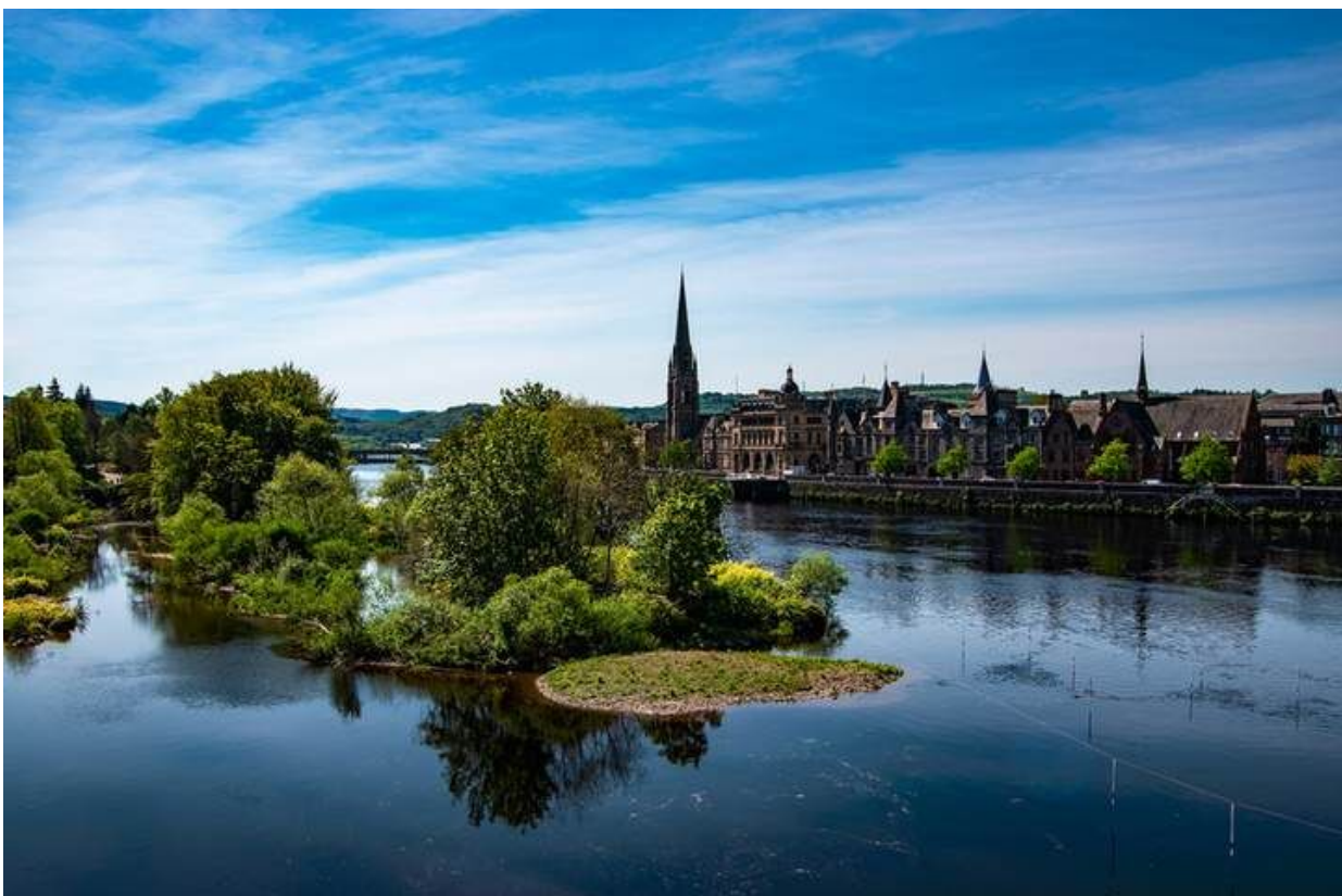
View of Perth City

For more information about Dundee please see: http://www.conventiondundeeandangus.co.uk and http://www.angusanddundee.co.uk