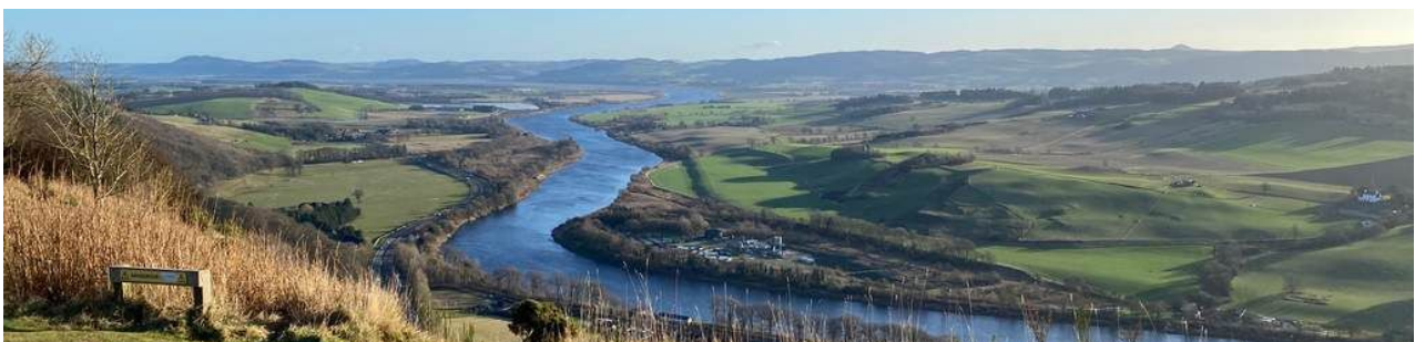
View from Kinnoull Hill

Dundee is also renowned as a friendly city where it is easy to mix. If your passion lies with the green, Tayside and North East Fife is one of the best places in the world for access to quality and affordable golf. 18 championship golf courses lie within 30 minutes and include St Andrews, the home of golf, Carnoustie and Gleneagles, which hosted the Ryder Cup in 2014. Within similar reach lie spectacular opportunities for everything from water sports to mountaineering, fishing and hillwalking.