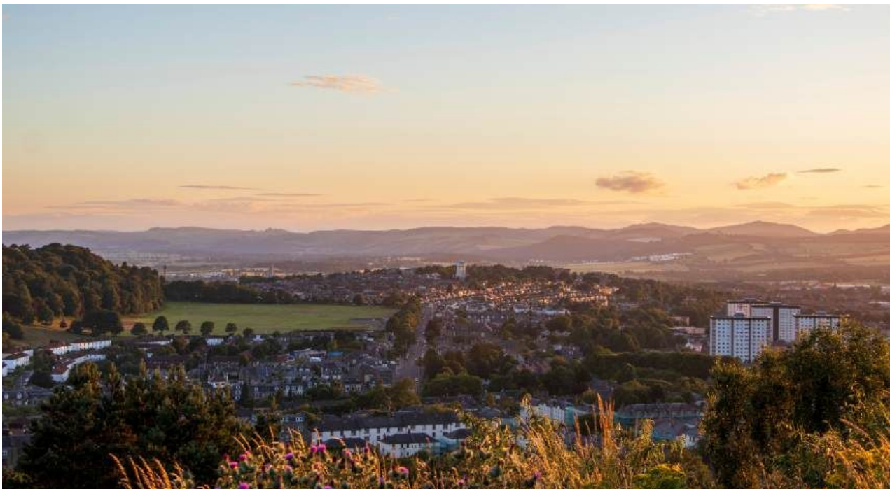
View across Dundee City

There are two hospitals which admit acute general medical patients and provide in-patient services; Ninewells Hospital, Dundee and Perth Royal Infirmary. The hospitals are 20 miles apart and there is a direct bus service to facilitate travel. There are a number of intermediate care hospitals in Angus and Perth & Kinross which also provide out-patient services. Ninewells Hospital and Medical School is a large teaching hospital for the University of Dundee and houses most medical and surgical disciplines with supporting laboratory services. Stracathro Hospital has been developed as an outpatient diagnostic and treatment centre.