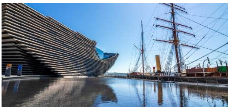
V&A Museum & The Discovery, Dundee

Excellent shopping sits side-by-side with a vibrant cultural quarter – home to Scotland's award-winning Dundee Rep Theatre and the highly acclaimed Dundee Contemporary Arts which has become a lively social hub and film house as well as a champion of leading edge arts. These are among the closest neighbours to our city centre campus. In addition, Dundee is the home of the 'V&A At Dundee', a new development housed in an award-winning, iconic building designed by Kengo Kuma.